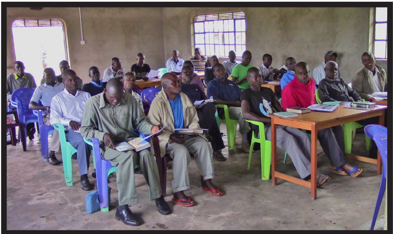
A BIBLE CLASS BEING CONDUCTED AT THE KALAMINDI SCHOOL OF PREACHING