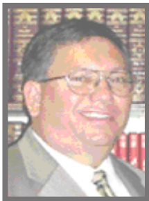
Evangelist of the Gospel of Christ